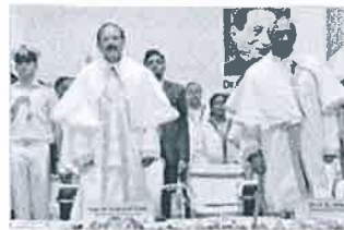
Vice President M Venkaiah Naidu and Odisha Governor S C Jamir during the 14th annual convocation of KIIT University in Bhubaneswar.

"Hence the students should be grateful to their gurus and at the same time work to serve mother, mother tongue, and motherland. There is nothing wrong in learning English, Hindi or French but students should also be proficient in their mother tongue which comes from the heart and helps one to express his feelings better," said the Vice President. He said the country will grow when the higher education sector develops. "We are in the age of LPG - Liberalisation, Privatisation, and Globalisation. Life has become very competitive therefore, students should prepare themselves for learning new skills and acquiring new knowledge in the contemporary world."