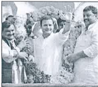
Rahul Gandhi visits the Ashardham temple in Banaskantha district, Gujarat, on Saturday.

Congress vice president Rahul Gandhi on Saturday began his three-day north Gujarat tour with a visit to the Ashardham temple of the Swaminarayan sect in Banaskantha district. The visit is significant as the Swaminarayan sect has a large following among the Patel community, now belligerent to the ruling BJP over the quota issue, but its head priest had last week openly asked the believers to remain loyal to the present government in the state.